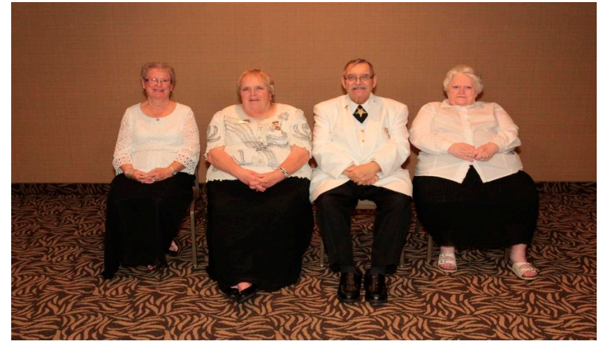
Subordinate Chapter Marthas