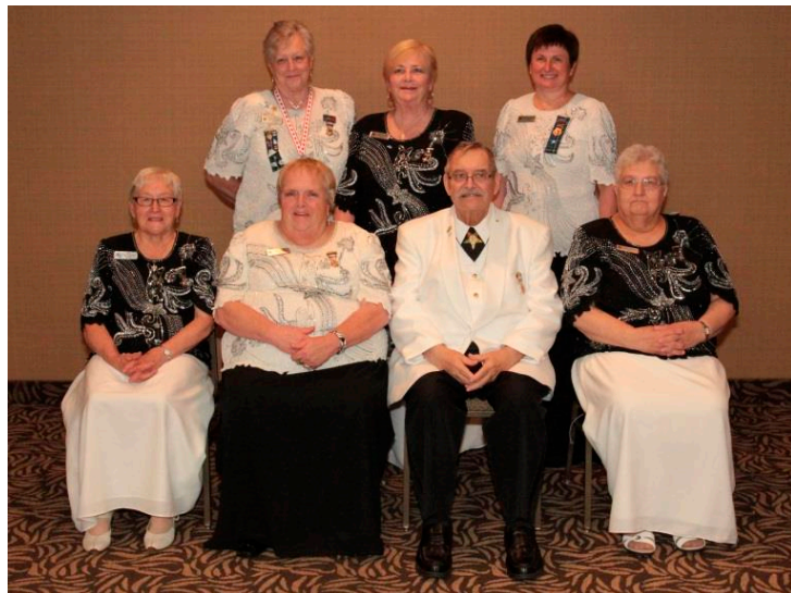
District Deputy Grand Matrons