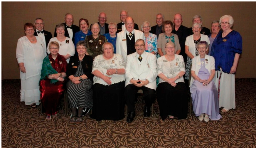
Past Grand Matrons and Past Grand Patrons