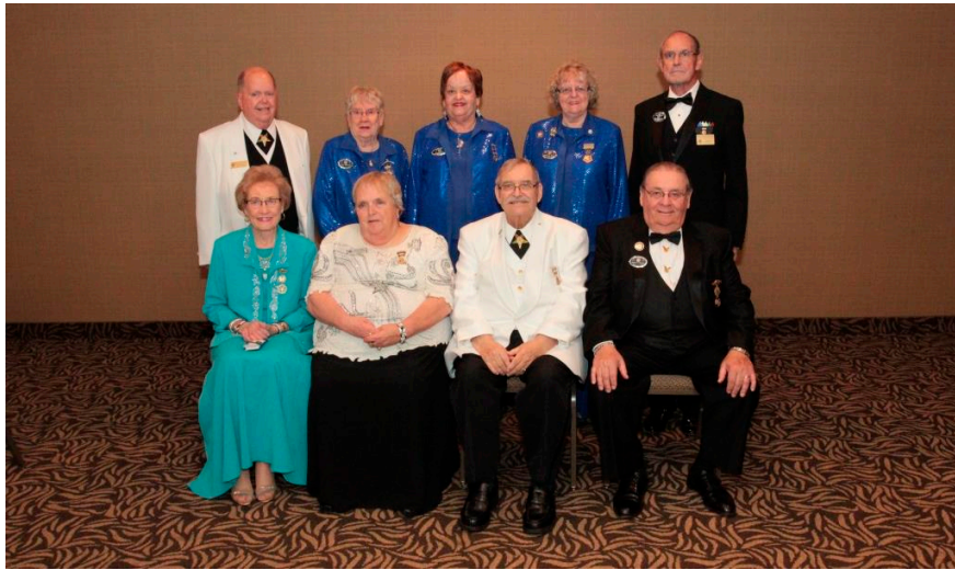
General Grand Chapter Committee Members